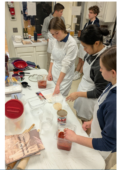
SOR students experiencing a variety of learning activities during J-Term last week.