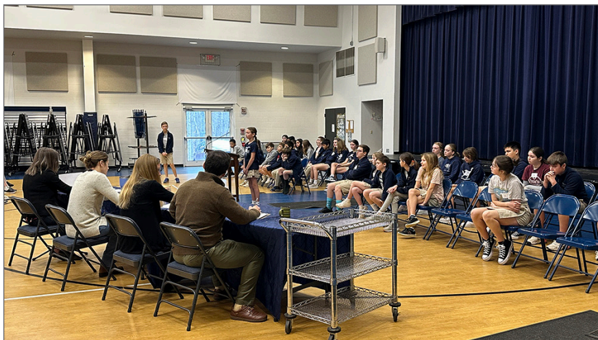
Middle School students and spelling judges listen attentively for the correct spelling at the annual MS Spelling Bee on Friday.