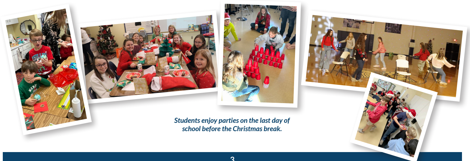
Students enjoy parties on the last day of school before the Christmas break.