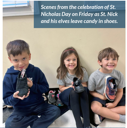
Scenes from the celebration of St. Nicholas Day on Friday as St. Nick and his elves leave candy in shoes.