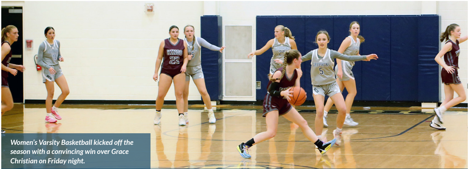
Women's Varsity Basketball kicked off the season with a convincing win over Grace Christian on Friday night.