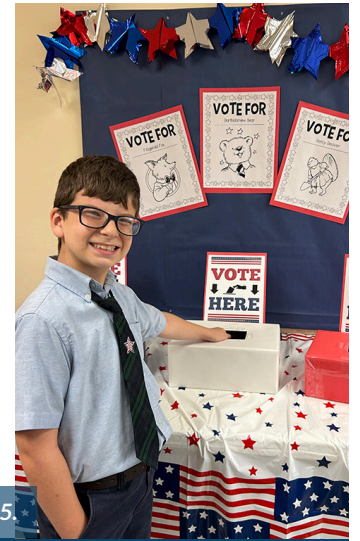
Fourth graders make their exuberant choice for "President of the Forest" on November 5.