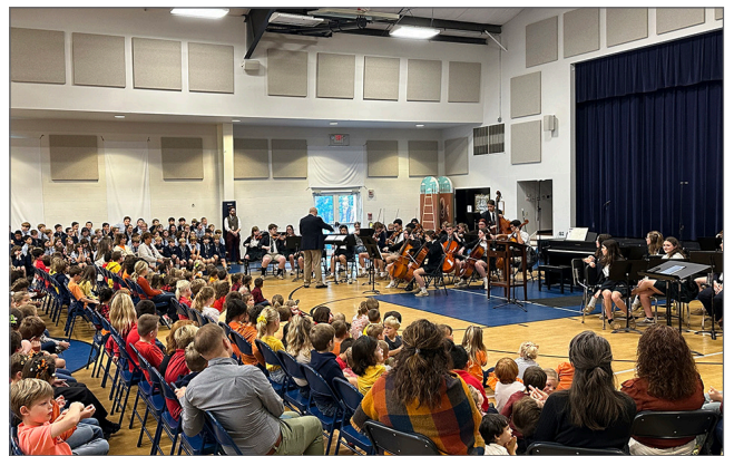
(Left) Smokey Bear visited Grammar School classes last week to raise awareness of fire safety. (Center) The SOR House Council sponsored its annual Trunk or Treat. (Right) An all-school assembly was treated to an excellent concert of the SOR orchestra, choir, and band on Thursday.