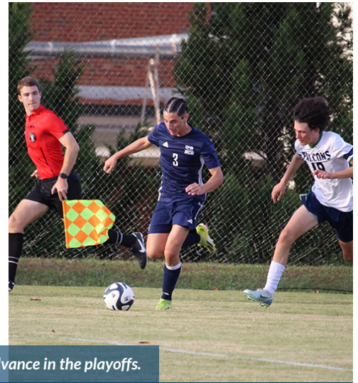
Varsity Men's Soccer takes Fredericksburg Academy 2-1 Friday night to advance in the playoffs.