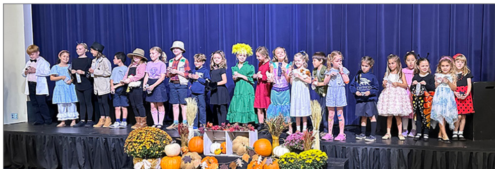
The Grammar School poetry recital was held on October 11 in the Moomaw Center. Parents, families and friends experienced a delightful display of characters and rhyme.