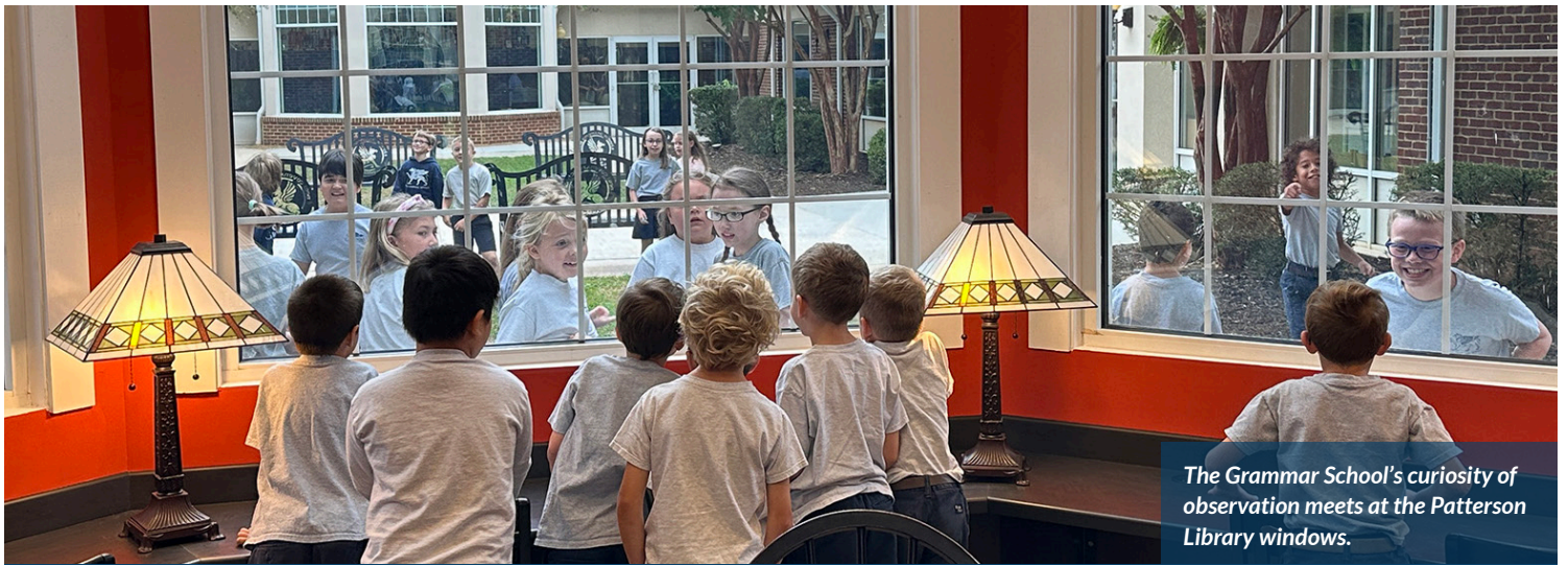
The Grammar School's curiosity of observation meets at the Patterson Library windows.