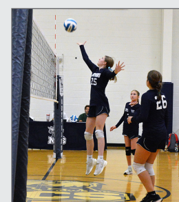
7/8 Girls' Volleyball have played with determination and teamwork all season long.