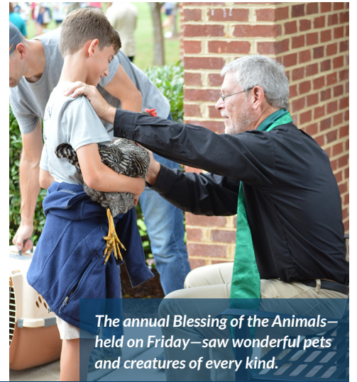
The annual Blessing of the Animals—held on Friday—saw wonderful pets and creatures of every kind.